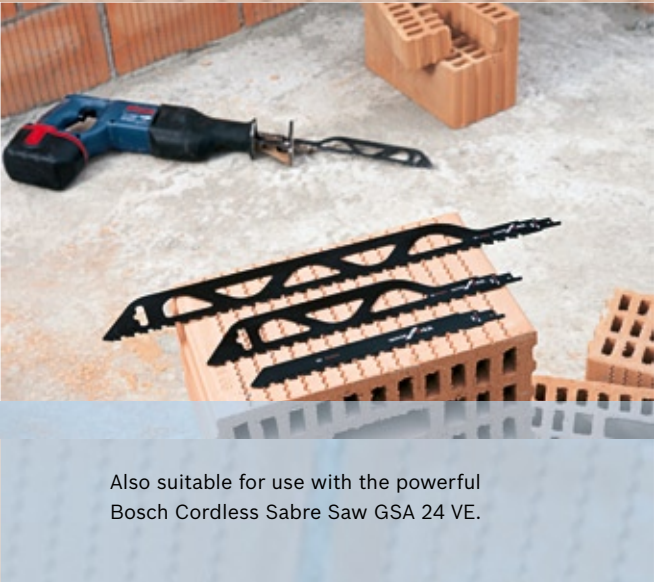
Also suitable for use with the powerful Bosch Cordless Sabre Saw GSA 24 VE.

Robert Bosch Limited Power Tools Division PO Box 98, Uxbridge Middlesex, UB9 5HJ. www.boschpowertools.co.uk www.bosch-pt.com