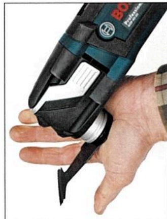
... by snapping it in