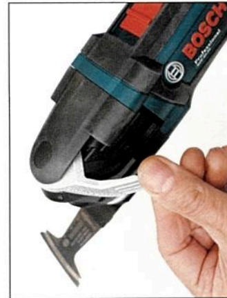
The old cutter is removed by simply pulling the SDS lever...