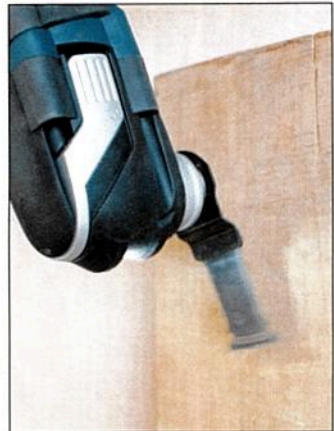
The worklight in action; note short oscillation stroke