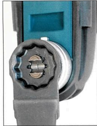
... and the sprung jaws keep it firmly in place