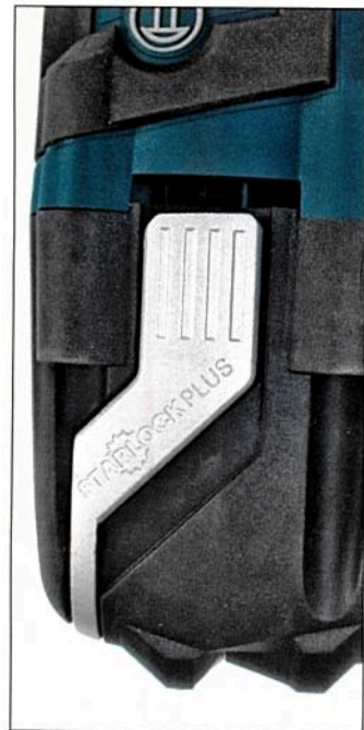
Close-up of the cleverly designed SDS lever – so simple to use