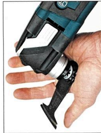
... and a new one fitted...