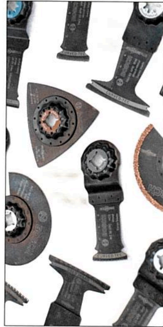
Just a few of the many different cutters and blades available