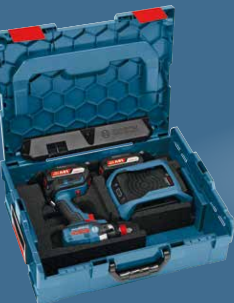
Wireless Charging inlay 1.600.A00.D6M

"Click and Lock" – Just click the L-BOXX into the Bay and the battery will charge while you drive